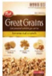
Banana Nut ✨