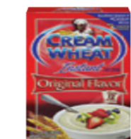
Plain in packets only ✨