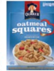
Brown Sugar ✨