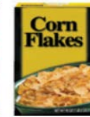
Plain any store brand ✨