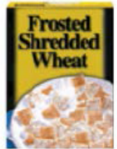
Bite size plain frosting only any store brand ✨