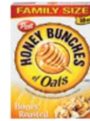
Honey Roasted Not "Just Bunches" ✨