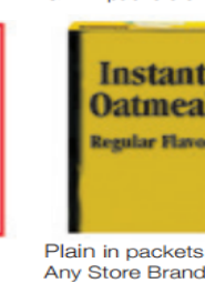
Plain in packets only Any Store Brand ✨