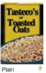
Plain any store brand ✨