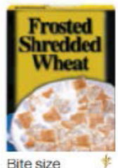
Bite size plain frosting only any store brand ✨