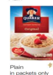
Plain in packets only ✨