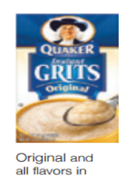
Original and all flavors in packets only ✨